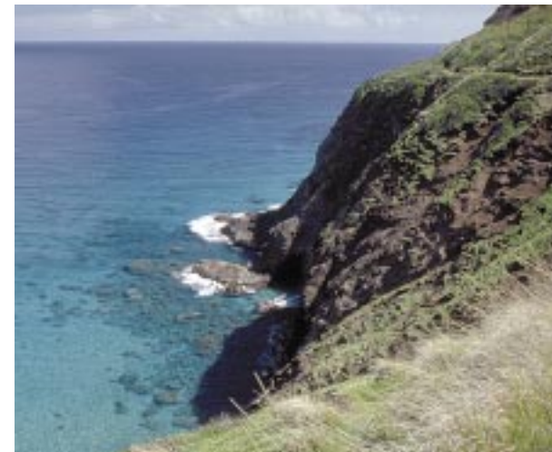
Kalalau Trail, Kauai

Unique Hawai'i tours for travelers interested in the environment and cultural and natural history.