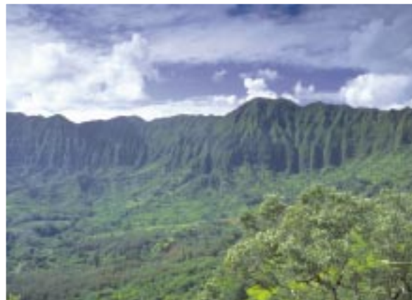
Maunawili Valley, Oahu